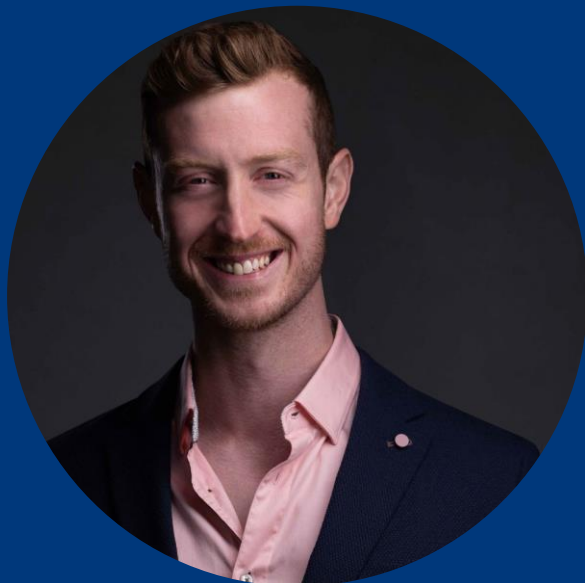
Head of Investments & Projects