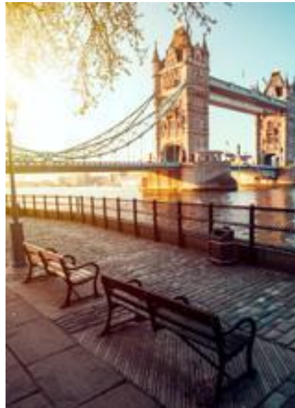
London UNITED KINGDOM