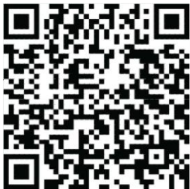
AR from QR code or link in case of smartphone users