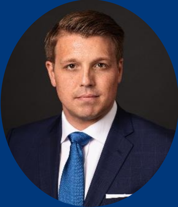
COO of Eterna International

Member of the Quebec Bar Association since 2004. He Co-founded an immigration law firm in Hong Kong in 2010 and is among the most experienced immigration lawyers in the wealth migration industry.